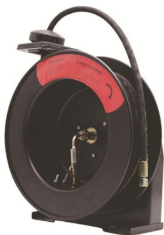
Automatic telescopic open type