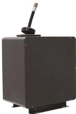
Automatic telescopic closed type